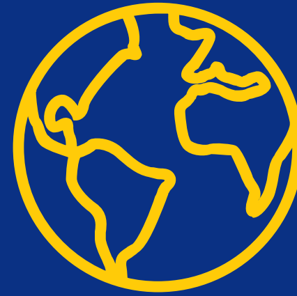
New York May 25 th , 2017